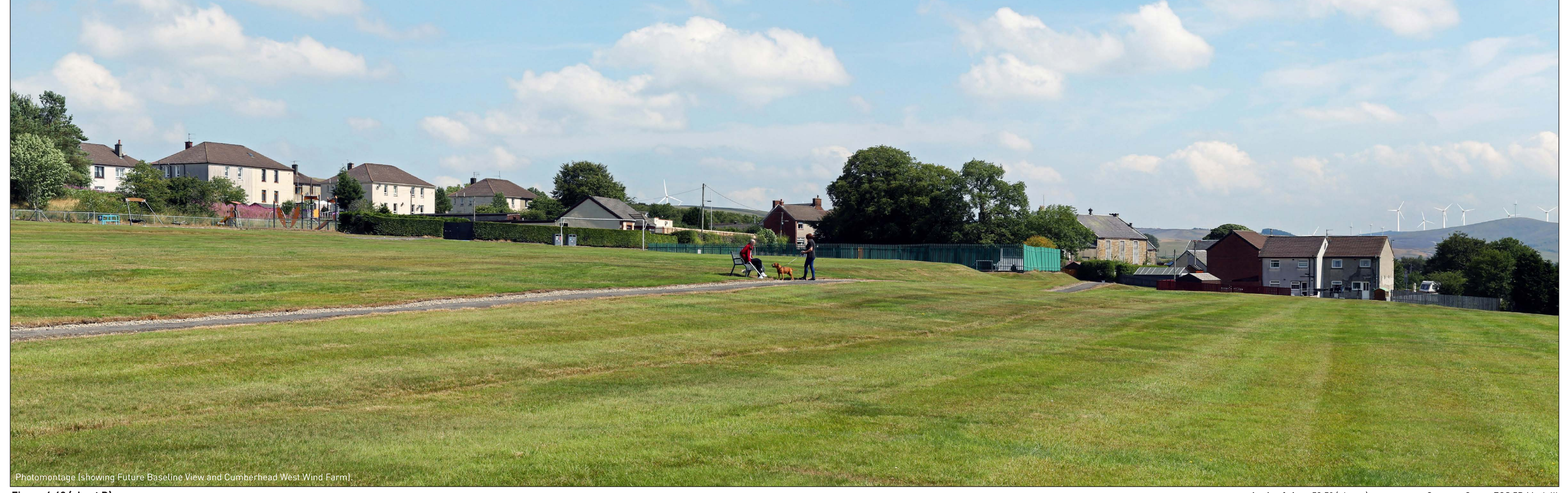
Figure 6.49 (sheet D) Viewpoint 13: Victory Park, Muirkirk CUMBERHEAD WEST WIND FARM