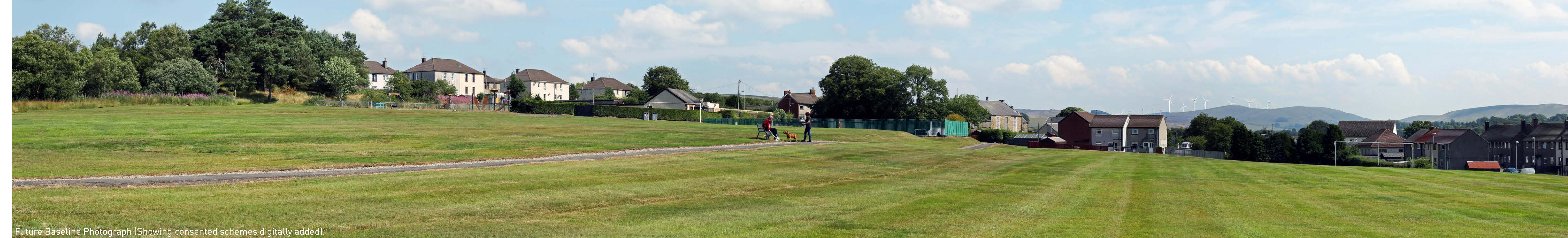
Figure 6.49 (sheet A) Viewpoint 13: Victory Park, Muirkirk CUMBERHEAD WEST WIND FARM