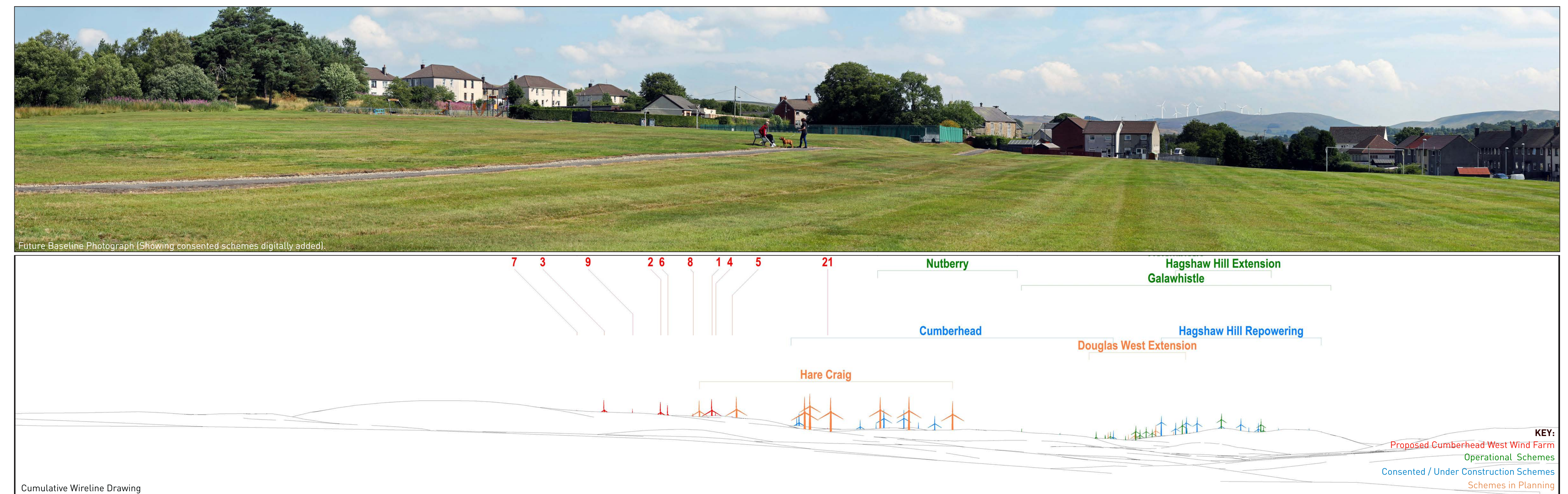
Figure 6.49 (sheet B) Viewpoint 13: Victory Park, Muirkirk CUMBERHEAD WEST WIND FARM